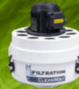
CleanMist Oil mist centrifugal filters