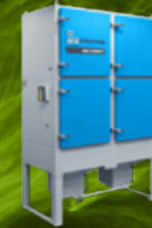
Mist compact Oil mist filters